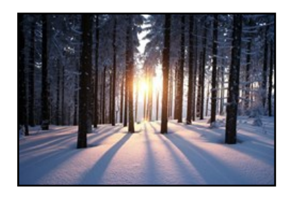
Visit the Koinonia website (christiancampohio.org)