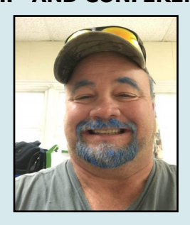
"Move It, Move It!"

Shhh... Don't let anyone in on my secret... I enjoy watching cartoons and cartoon type movies. One of my favorite memories of growing up personally was Saturday mornings. My siblings and I were allowed to have cereal in the living room and watch Saturday morning cartoons. Bugs Bunny, Space Ghost, and my all-time favorite and maybe the best ever Saturday morning cartoon... The Amazing Spiderman.